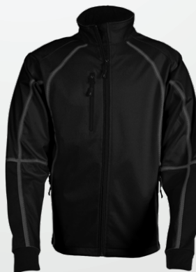
748 - Black/Black

Other Locations: L/R Sleeve, L/R Cuff, Back Nape