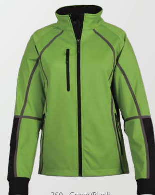
750 - Green/Black