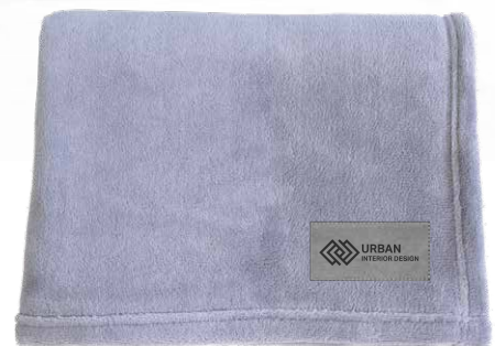
SHOWN WITH GREY PATCH