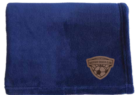
SHOWN WITH BROWN PATCH